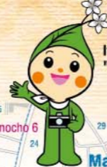
Itabashi Tourist Mascot "Rin-Rin-chan"