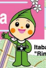
Itabashi Tourist Mascot "Rin-Rin-chan"